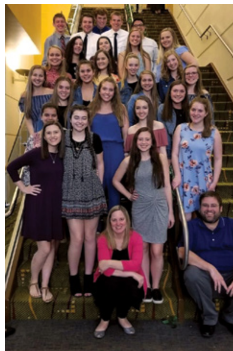
Student councils, like the the Bay Port High School Student Council (pictured above), can help encourage students to make their voice heard.

There are only a handful of schools in Wisconsin that continue to make an investment in their student leaders and are seeing incredible change because of that investment. The Howard-Suamico School